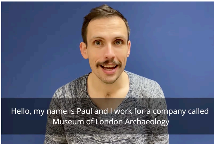
Left: Screenshot of the LotF / MOLA video available on YouTube